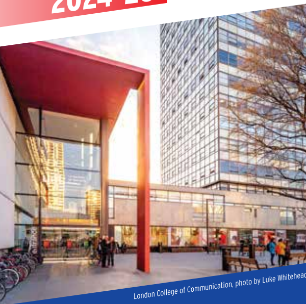
London College of Communication

For HKDSE, IB and other Secondary School Graduates 為香港中學文憑試及國際文憑畢業生或同等學歷人士而設